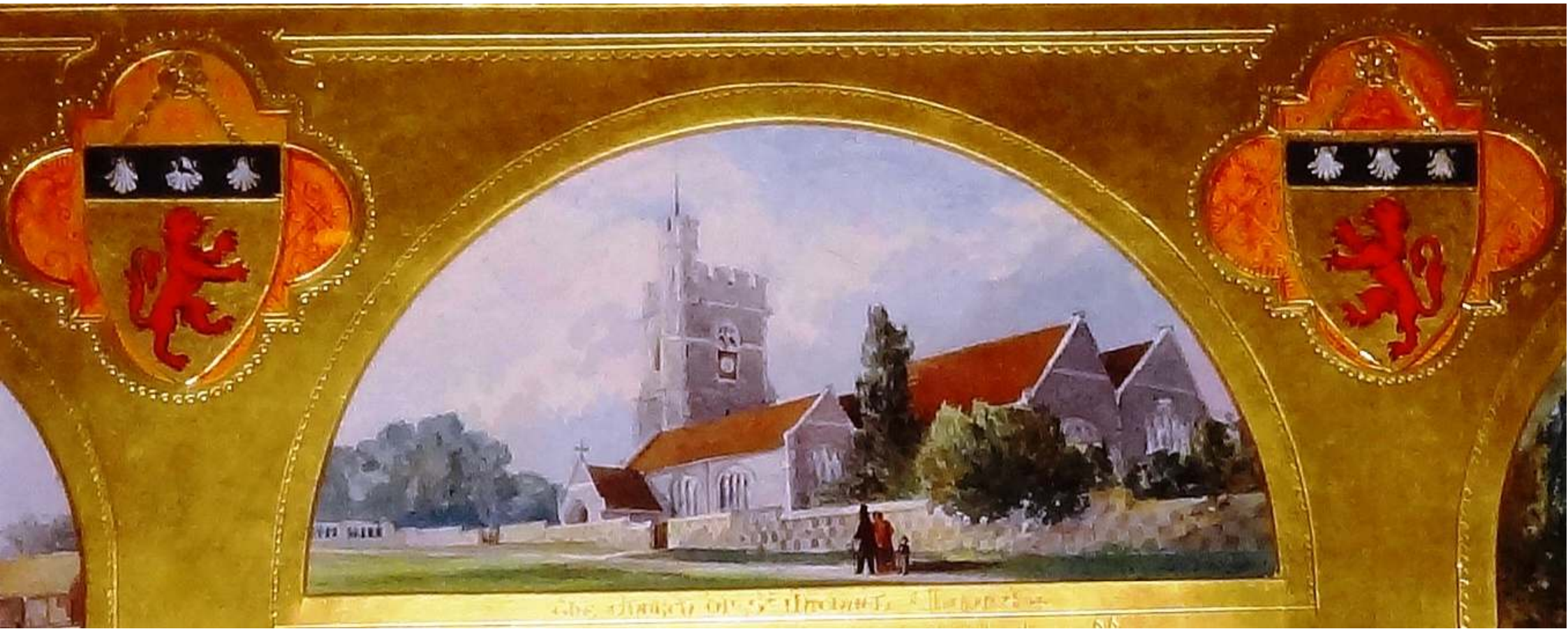
The church of St. Martin, 1840