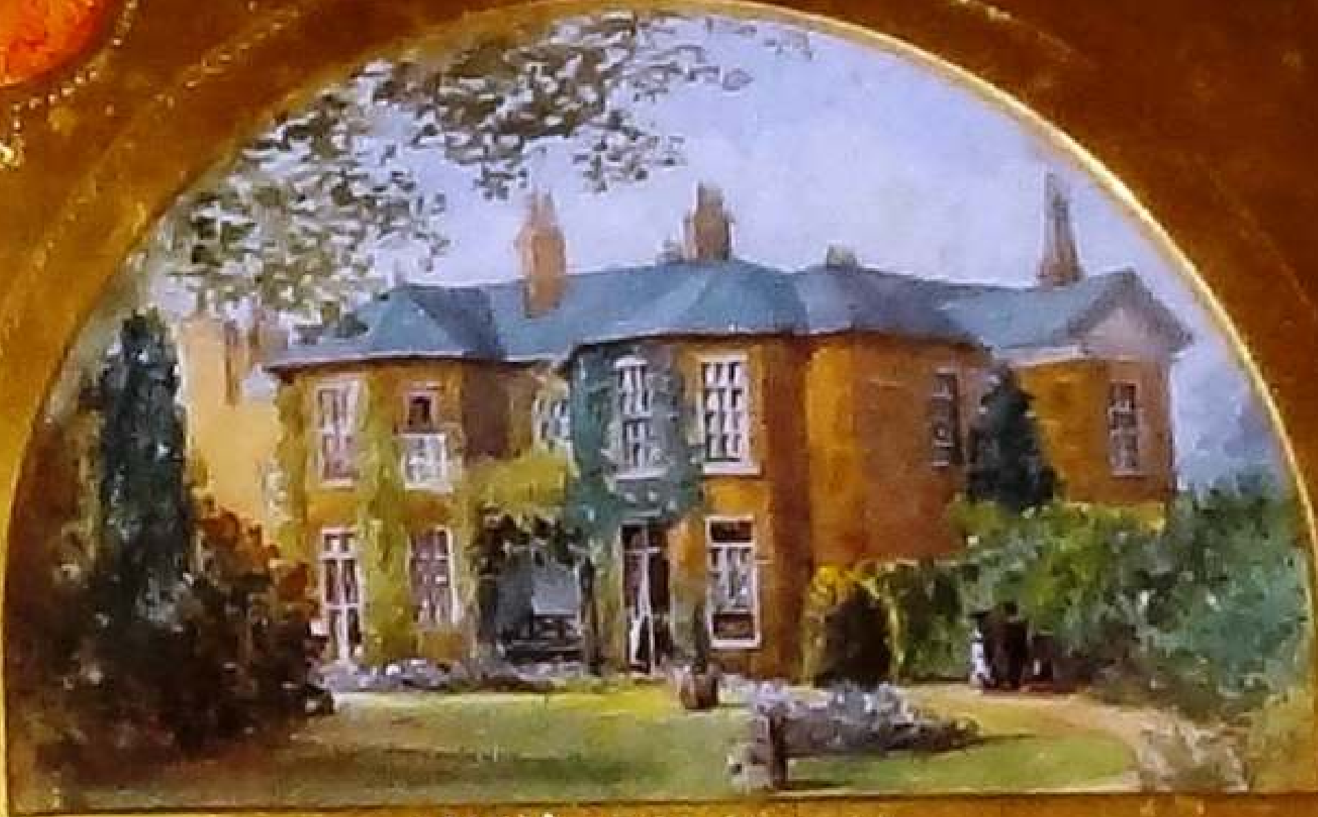
Stoughton High School Building